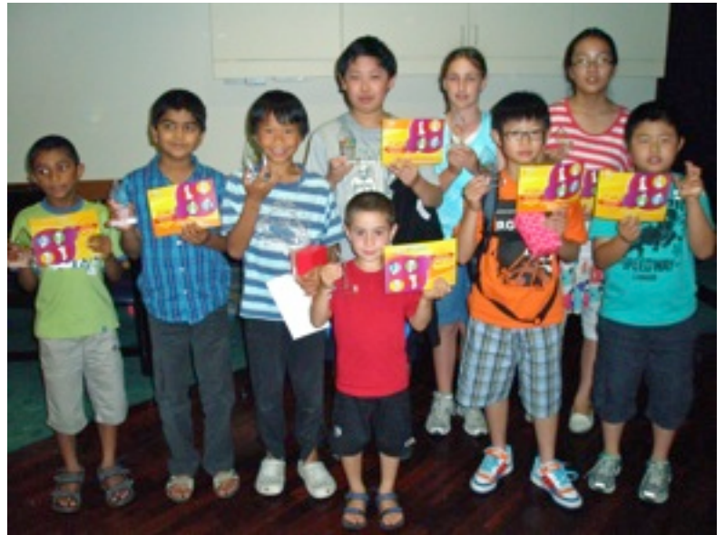
Trophy winners at the Feb. 2011 RJ Shield.

It was a great day with a number of interstate players participating as a warm-up for the National Finals.