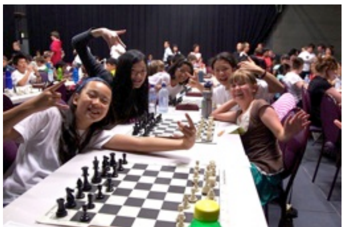
It's not all serious at the Aust. Junior!