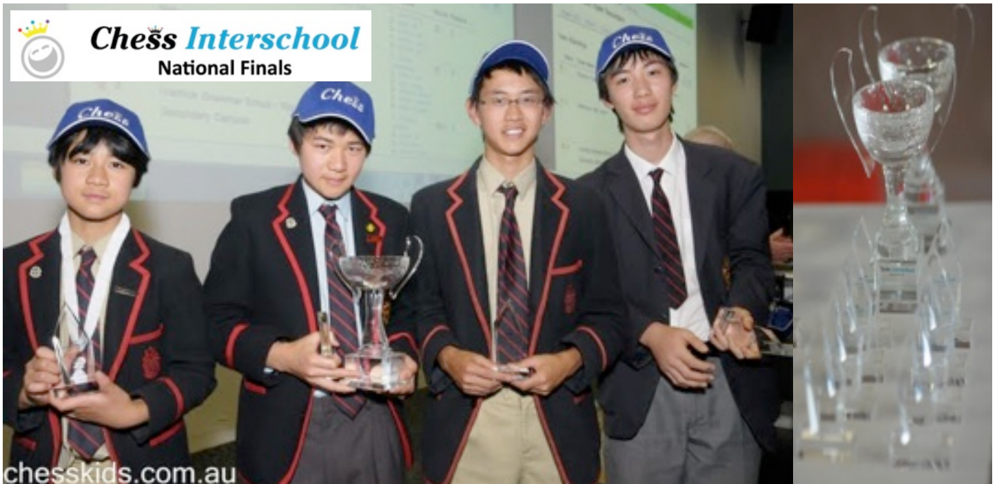
Secondary Winners - Brighton Grammar School

The Interschool National Finals took place in November 2010 at Monash University and again attracted teams from all over Australia and New Zealand.