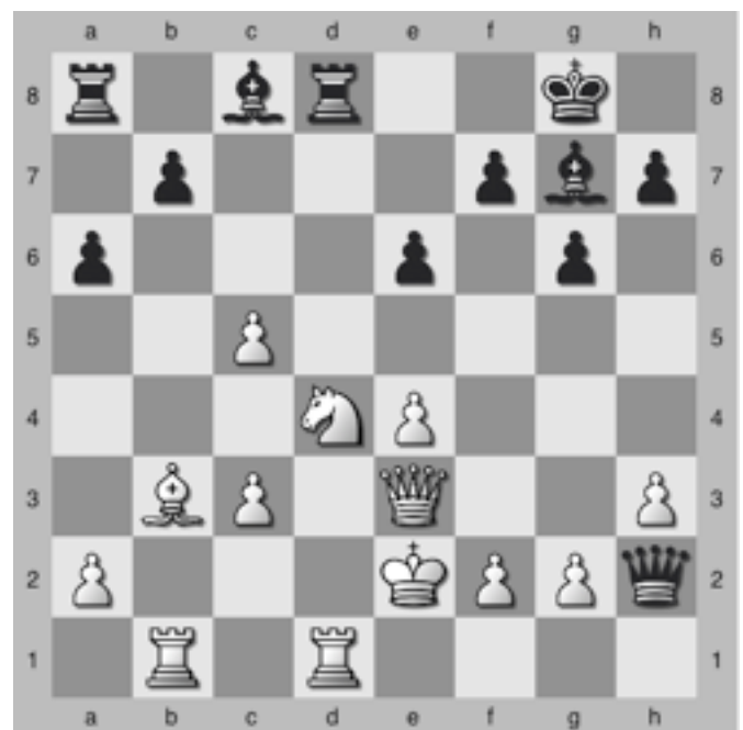
White to play his 21st move.

Qb2+ 30.Rd2 Qb1 31.Qxf7+ Kh6 32.Qf8+ Kg5 33.h4+ Kxh4 34.Qh6+ Kg4 35.f3+ Kg3 36.Qh3+ Kf4 37.Qg4+ 1-0